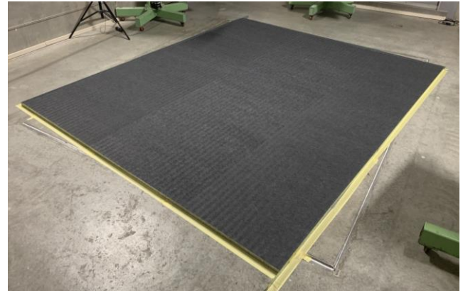
Test specimen installed in laboratory for test