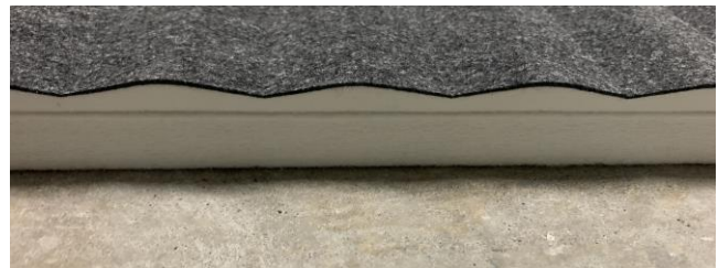
Side view of specimen prior to skirt installation